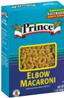
Prince Pasta (exc. lasagna & jumbo shells) 10/$10 00