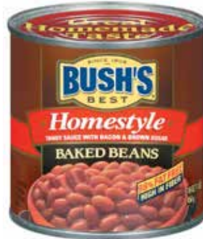
Bush's Variety Beans 10/$10 00